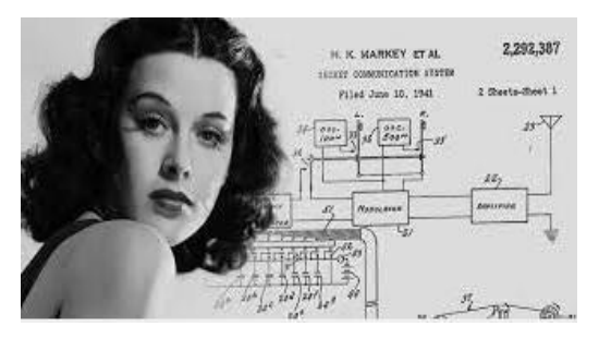
Year 5: Hedy Lamarr Class

In Maths, Year 5 have been multiplying by 10, 100 and 1000. In English, they have been discussing the controversy surrounding the World Cup in Qatar and also discussing the issues with LGBT+. In Science, the children have been looking at the different stages of pregnancy and in Computing, they have been continuing to add hyperlinks to their apps.